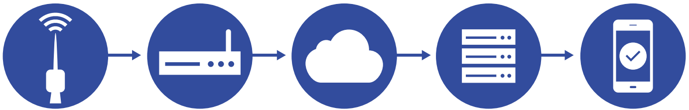
The step-by-step process of Green Stream’s LoRa-enabled solution.