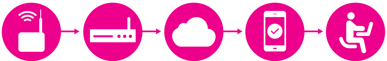
The step-by-step process of Capgemini's LoRa-enabled solution